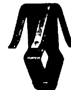
1850.....$1.25Ea Hood Louvre Mld Fastener Chrysler 1939