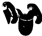
1765.....$1.25Ea Body Belt Mld Fastener Desoto 1938