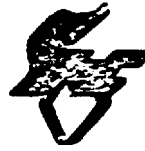
1339..... $1.00 Each GM Door Flange Weatherstrip Fastener 1937