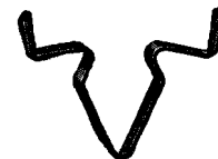
2081C..... .60 Each Weatherstrip Fastener, Chrysler 60'S