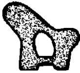
4759 Without Clips $2.50/Ft 4759 With Clips $3.00/Ft GM Other 55-70