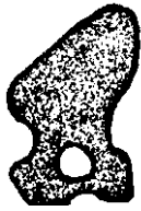
4792.....$2.50/Ft GM-Others 60-70