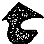
2S41N.....$4.50/Ft Merc. Benz-Foreign 55-63