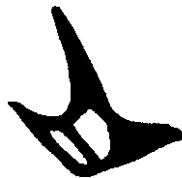
4796.....$2.50/Ft 1968 & Up Chrysler Corp. Cars- Door W/S With Clips