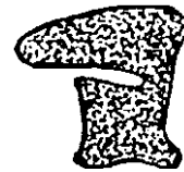
13104K.....$3.00/Ft General Motors 49-53 Lower Door Seal