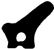
4779.....$3.00/Ft Camaro, Firebird 70-81 'F' Body-Others