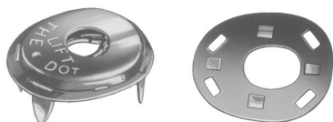
XX16205 Socket BS16506 Clinch $1.50/Set Nickel or Black