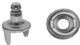
XB-16350 Stud BS-16501 Clinch Single or Double $1.00 Set