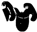
1765.....$1.25Ea Body Belt Mld Fastener Desoto 1938