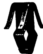
1850.....$1.25Ea Hood Louvre Mld Fastener Chrysler 1939