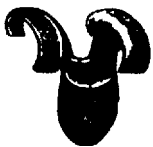
1365.....$1.25Ea Body Belt Mld Fastener Chrysler 1937

Many sizes and types of these clips are available. Please send pictures or samples.