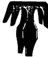
1363.....$1.65 Ea Hood Mld Fastener Plymouth 1935