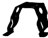
1848.....$1.25Ea Radiator Shell Mld Fastener Plymouth 1939